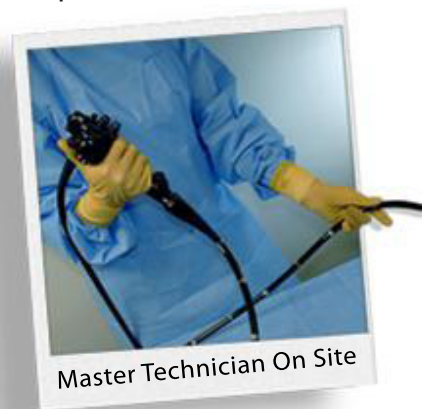
Master Technician On Site